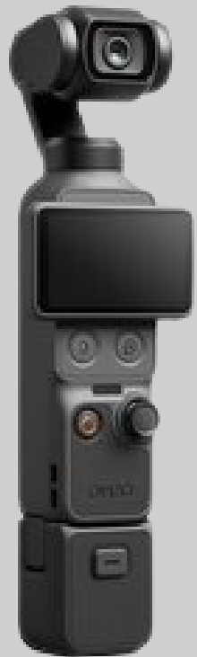
DJI OSMO 2

Since migration is a sensitive topic, we used smaller cameras to create a more comfortable environment for both the public and interviewee but for some Broll we used the Canon R6 M 3